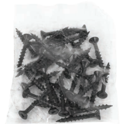
1 1/4" Screws