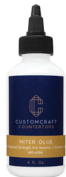
Water Resistant Glue