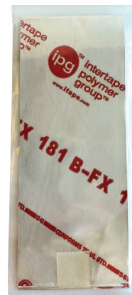
Moisture Barrier Tape